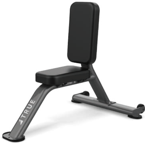
TRICEPS SEAT XFW-4400