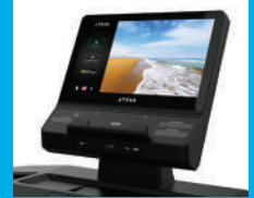
ENVISION II 16" Touchscreen