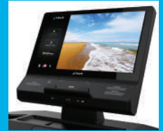
ENVISION II 22" Touchscreen