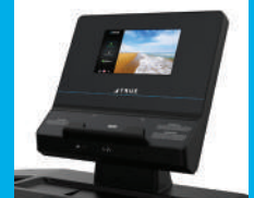
ENVISION II 9" Touchscreen