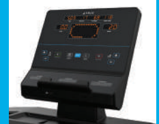
EMERGE II Classic LED