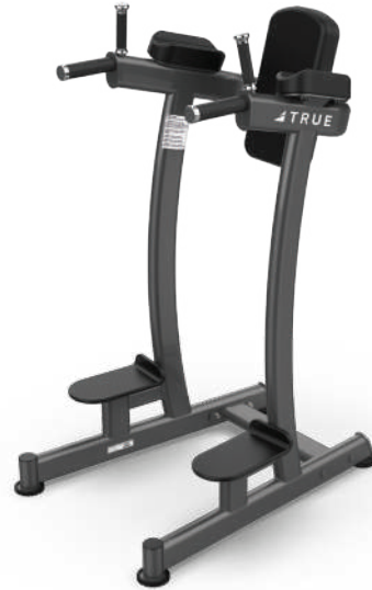
VERTICAL KNEE RAISE/DIP XFW-6400