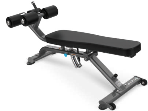
ABDOMINAL/ DECLINE BENCH XFW-5300