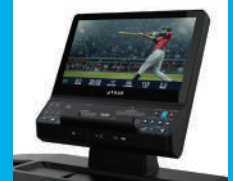
SHOWRUNNER II 16" Integrated LCD