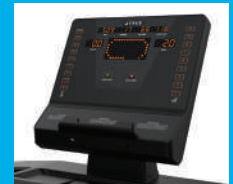
IGNITE II Perfect for HIIT classes